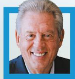
约翰·麦克斯韦尔 John Maxwell 曾任卫理公会牧师、 美国极具影响力的管理大师; 创立“教牧领袖培训中心” (INJOY) 与“领袖装备中心” (EQUIP), 畅销作家