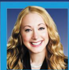
塔莎·欧里希 Tasha Eurich 欧里希集团 (The Eurich Group) 创始人、 组织心理学家、研究学者、 畅销书作者