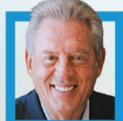
约翰·麦克斯韦尔 John Maxwell 曾任卫理公会牧师、 美国极具影响力的管理大师; 创立“教牧领袖培训中心” (INJOY) 与“领袖装备中心” (EQUIP), 畅销作家